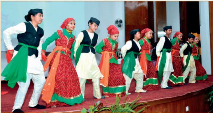
केंद्रीय विद्यालय के बच्चों द्वारा सांस्कृतिक प्रस्तुति