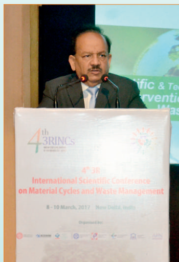
Dr Harsh Vardhan, Hon'ble Minister of Science and Technology & Earth Sciences

The 4 th 3R International Scientific Conference on Material Cycles and Waste Management organized by the Council of Scientific and Industrial Research (CSIR), the CSIR-Indian Institute of Petroleum, the CSIR-Central Building Research Institute, Roorkee, the Japan society of Material Cycles and Waste Management, the Korean Society of Waste Management, the Indian Institute of Technology Delhi, and the International Society of Waste Management, Air & Water, was held at the India Habitat Centre, New Delhi from March 8-10, 2017. Over 300 delegates, speakers and participants from 12 countries attended the conference. Exhibitors from different industries displayed their company profiles, products, services and technologies. The conference comprised of several technical sessions on various 3R issues. The Indian Union Cabinet Ministers, Dr Harsh Vardhan, Minister of Science and Technology, Mr Ananth Kumar, Minister of Chemicals and Fertilizers, and Mr Suresh Prabhu, Union Railways Minister, graced the conference with their presence. They also emphasized on the necessity of 3R for the control and reuse of various wastes in India.