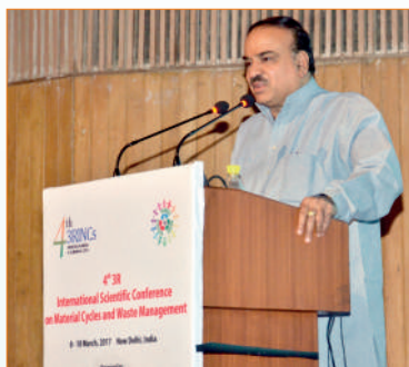
Mr Ananth Kumar, MoCF

annually. He announced that his Ministry is ready to ink an MoU with the CSIR for setting up a task force for promoting 3Rs. He appealed to use "2R (Reuse, Recycle)" material instead of "waste material".