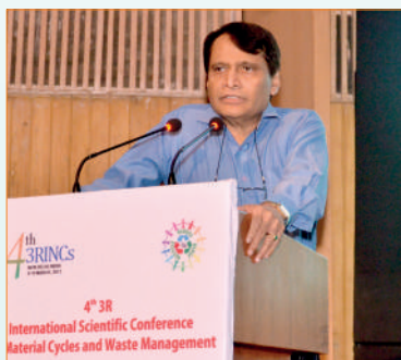
Mr Suresh Prabhu, MoR

annually. He announced that his Ministry is ready to ink an MoU with the CSIR for setting up a task force for promoting 3Rs. He appealed to use "2R (Reuse, Recycle)" material instead of "waste material".