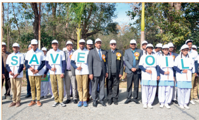
'Save Oil' message through human chain formation