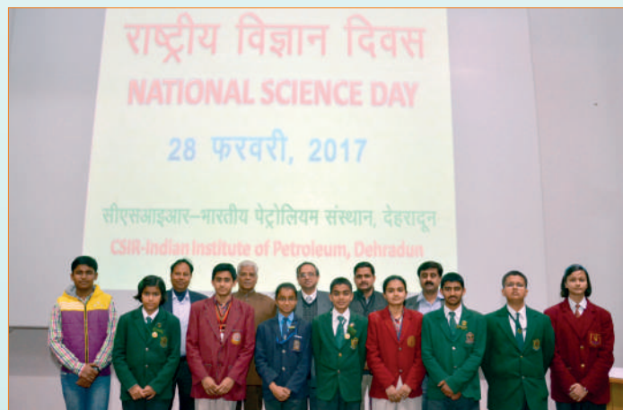
The felicitated students