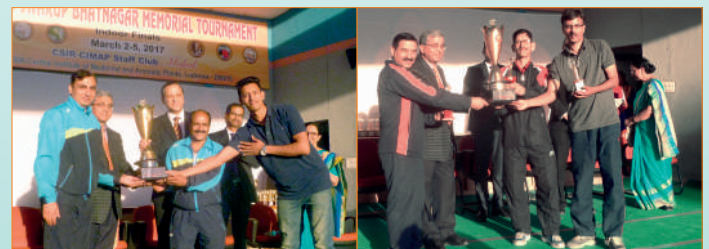
Badminton Event Winners