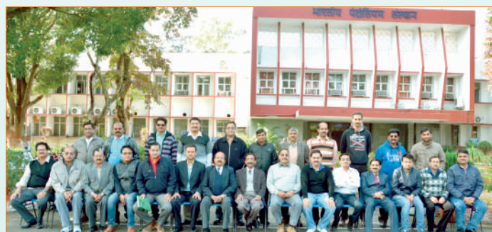
Faculty & trainees of the training programme on 'Indian Road Traffic and Energy – Challenges and Opportunities' for MoRTH, New Delhi January 9-13, 2017