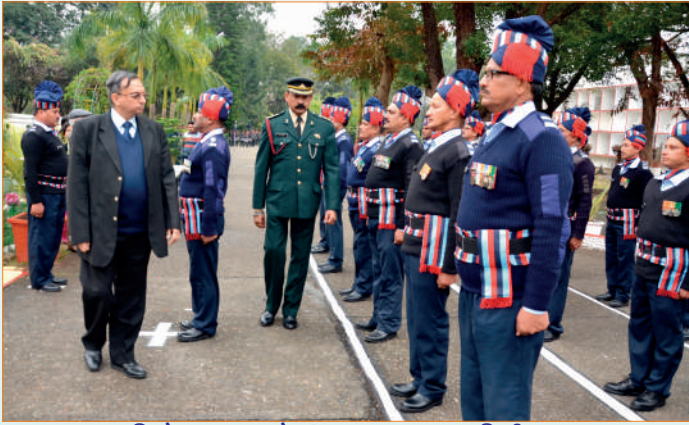
निदेशक, भापेसं द्वारा गारद-निरीक्षण