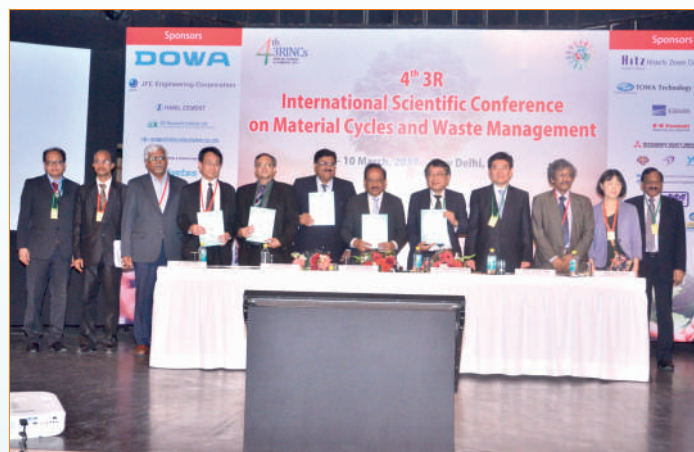
Delegates releasing the Souvenir